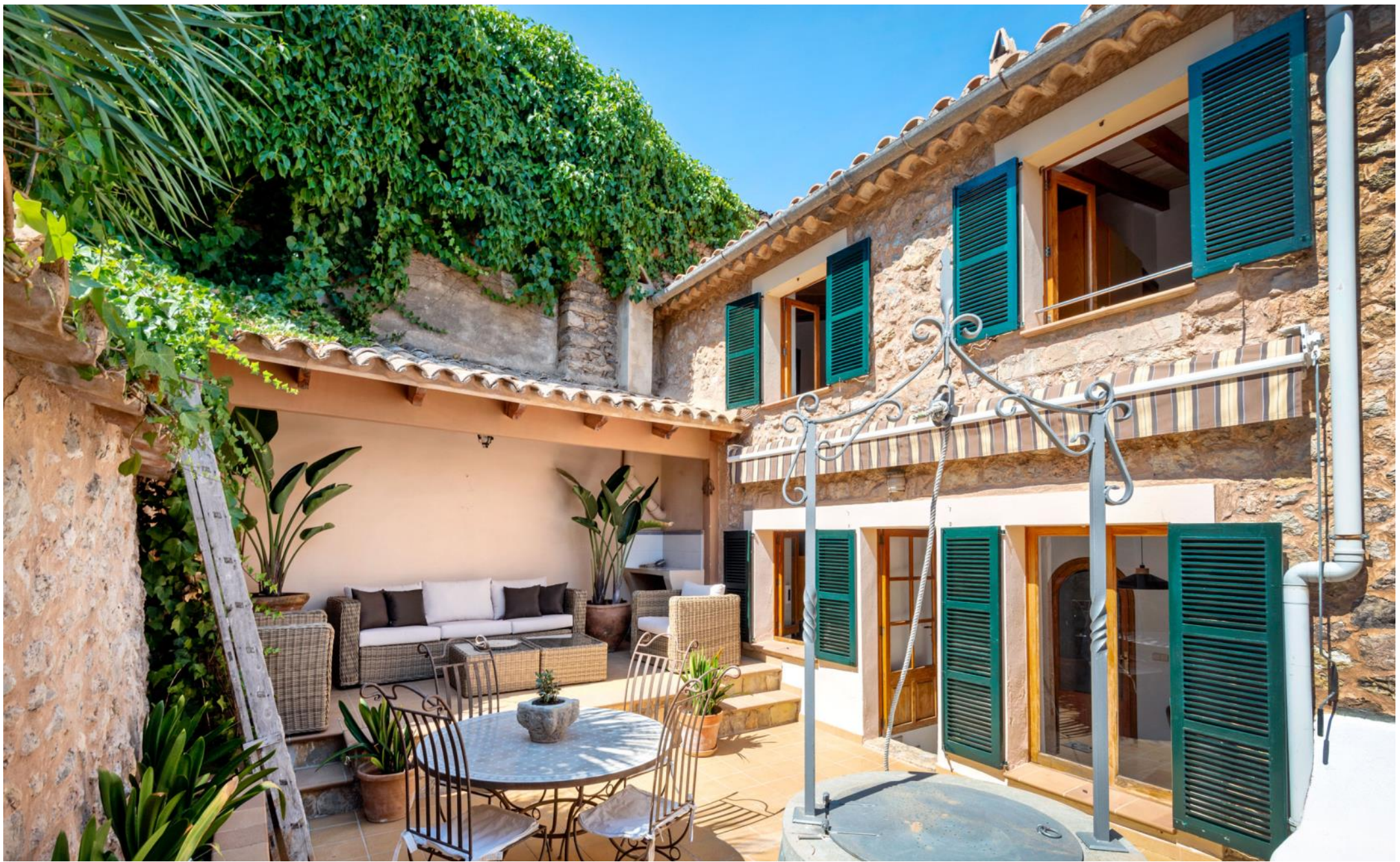
Patio outside the kitchen and dining room