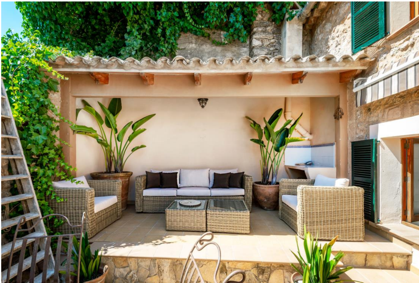
Patio and lounge area