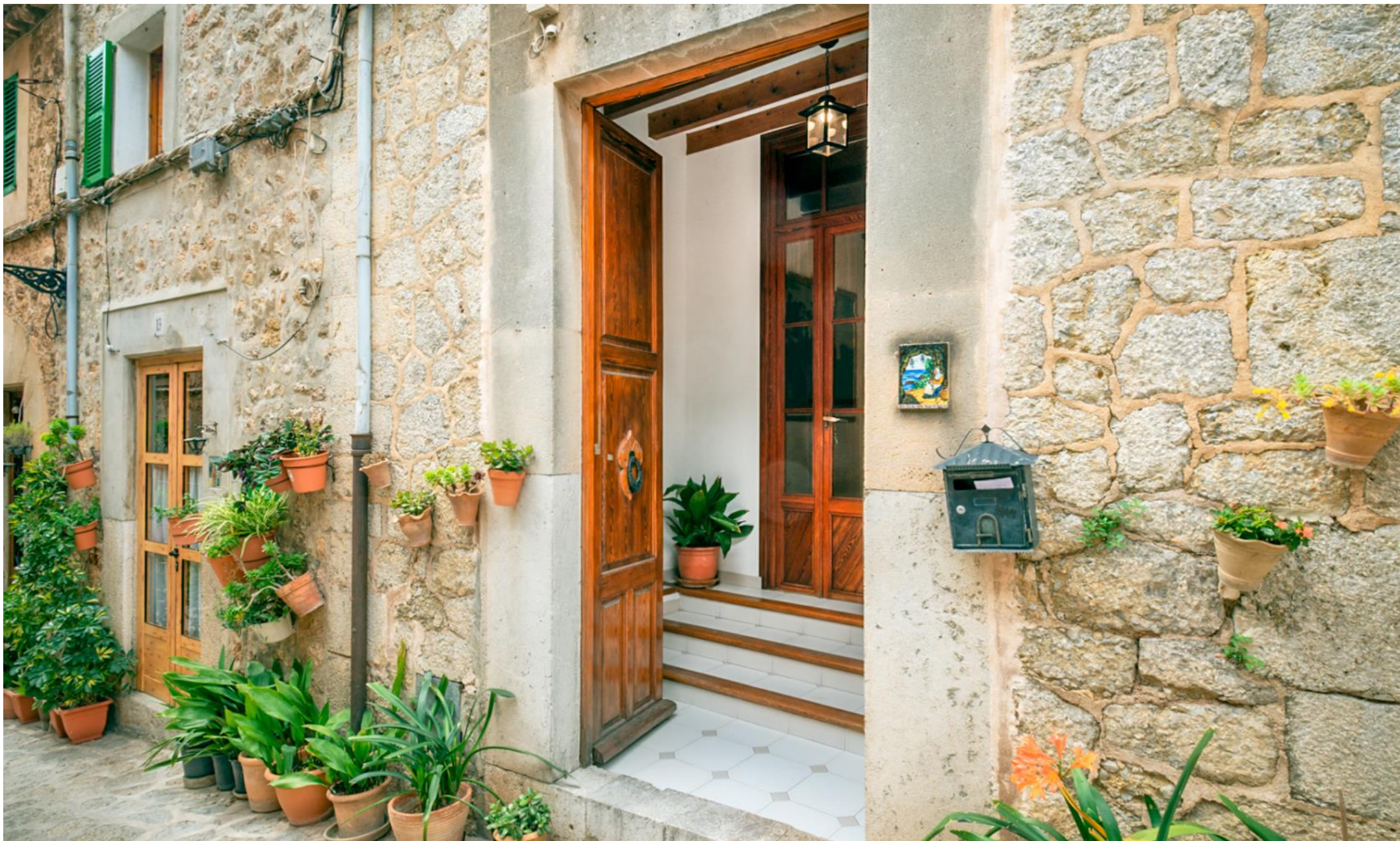
Entrance from the street